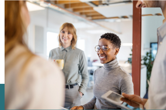
Kyndryl and Microsoft partner to power your progress