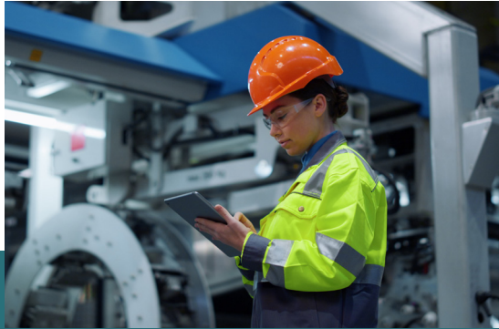
Kyndryl capabilities and portfolio

Kyndryl generative AI services, featuring Microsoft Copilot, aims to increase productivity and enhance employee experience, catering to the specific needs of each customer and prospect. This partnership supports customers through: